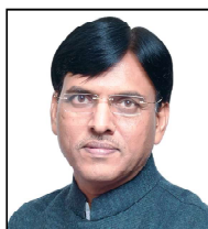
By: Dr Mansukh Mandaviya

Beginning with the G20 Health Working Group Meeting in Thiruvananthapuram, India will unveil its vision of a Global Health Architecture that enables both rich and poor countries to access universal healthcare and resist the emergencies caused by epidemics and pandemics.