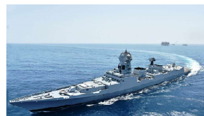
The Indian Navy frigate participating in exercise- "Varuna 2023".

advanced air defence exercises, tactical manoeuvres, surface firings, underway replenishment and other maritime operations. Units of both navies will endeavour to hone their war-fighting skills in maritime theatre, enhance their inter-operability to undertake multi-discipline operations in the maritime domain and demonstrate their ability as an integrated force to promote peace, security and stability in the region.